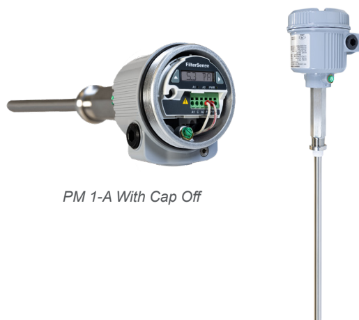
PM 1-A With Cap Off

3-5x More Functionality when compared to comparable devices.