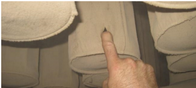
A 0.75” control slit was cut into 1 of 500 filters.

After confirming the filters were in good non-leaking condition, baseline and cleaning cycle peak readings from the DynaCHARGE™ were observed. Baseline and Pre-Visible alarm levels were set. The plant then began a series of controlled leak tests. First, a single 0.75” slit was cut in one of the 500 filters.