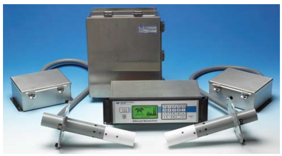
Enhanced Remote Panel

Each of the two transducers alternately acts as transmitter and receiver. The purge nozzles are constructed of acid-resistant Teflon with stainless steel or Hastelloy hardware for easy cleaning and a long service life. Each transducer assembly is made of lightweight aluminum stock and can be easily extracted from its mounting port by disengaging four draw latches.