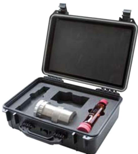
Transport case for filter holders

with a paid license. Allows to obtain, in addition to the SUPERVISOR functions, also full remote operation of DECS ® from workstation PC where Control & Supervision software is installed.